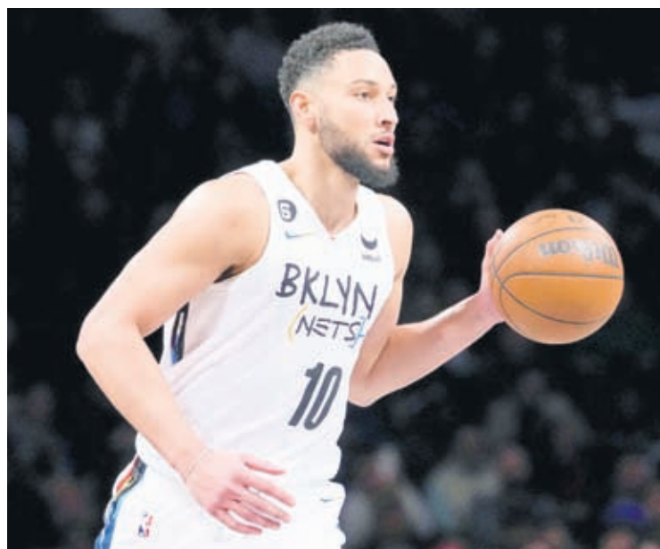
Brooklyn Nets guard Ben Simmons plays during the first half of an NBA basketball game against the Phoenix Suns, Tuesday, Feb. 7, 2023, in New York.